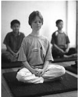
Boys learning Anapana meditation

During the course, students learn the technique of Anapana meditation, which is the first step in the practice of Vipassana meditation.