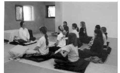
Children are inquisitive to learn meditation

Although highly esteemed, Mr. Goenka is a teacher without followers, always emphasising the importance of being one's own master, truly self-reliant. This he imparts to his students – both children and adults.